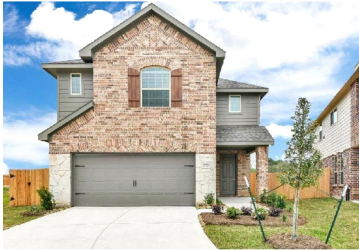
REPRESENTATIVE IMAGE *