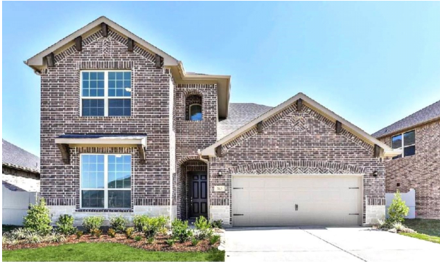
REPRESENTATIVE IMAGE *